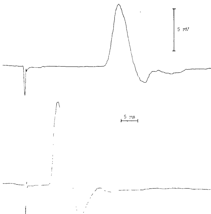
Fig 2—Muscle action potentials recorded from surface electrodes over abductor digiti minimi resulting from magnetic stimulus applied to opposite motor cortex (latency of response 23 ms) (upper) and to ulnar nerve at elbow (latency of response 7 ms) (lower).

When the coil is placed on the scalp, over the appropriate region of the motor cortex, movements of the opposite hand or leg are easily obtained without causing distress or pain. The first cortical stimulations by this method were carried out with P. A. Merton and H. B. Morton at the National Hospital, Queen Square, London. Each twitch, in response to a single stimulus, is accompanied by a muscle action potential (fig 2, upper) just as with electrical stimulation through the scalp or at peripheral sites. Stimulation is assumed to be due to the current induced in the tissue by the rapid, time-varying magnetic field.